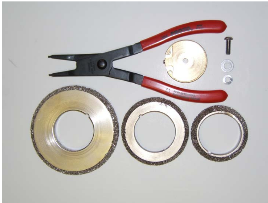
TranSTAR MegaTRAK Wheel Kit